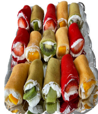
Mochi Crepes 5 pieces Gluten Free 10 Gluten Free Rice Flour, Milk, Egg, Butter, Fresh Fruits