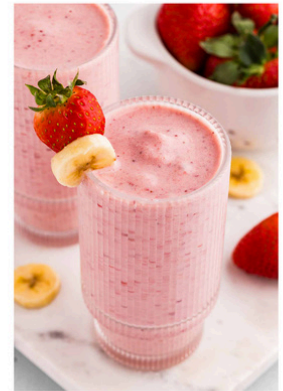
Strawberry Banana Smoothie 6