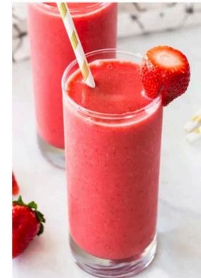
Strawberry Smoothie 6