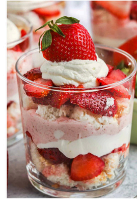
Strawberry Shortcake Fresh Strawberries, Soft Cake, Whipping Cream 6

Prepared From Scratch Homemade Fresh Healthy Tasty