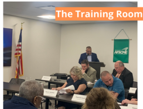
The Training Room

INTERESTED IN A TOUR OF THE AMENITY CENTER? CONTACT MANAGEMENT AT 412-921-8500.