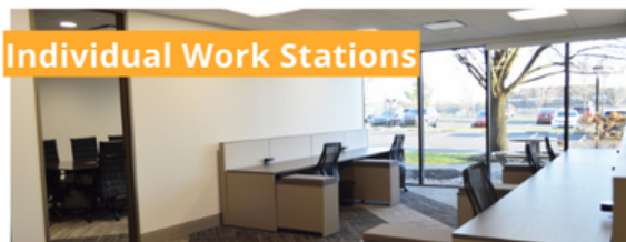
Individual Work Stations