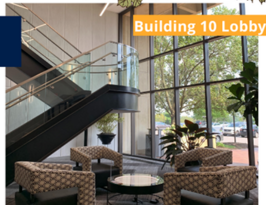
Building 10 Lobby

SWITCH UP THE SCENERY & HOST YOUR MEETING IN THE AMENITY CENTER! OUR ROOMS ARE EQUIPPED WITH WIFI, SMART/APPLE TVS, POLYCOM TELEPHONE, PROJECTOR WITH HDMI, WHITEBOARD WALLS, & PLENTY OF COMFY SEATING ALL WHILE CONVENIENTLY CLOSE TO OUR TENANT LOUNGE, CENTRAL STATION, & FOSTER CAFE.