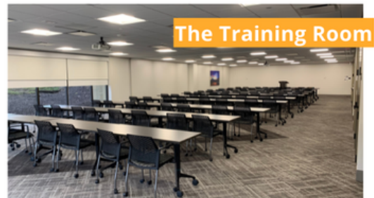
The Training Room