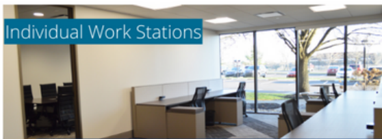
Individual Work Stations