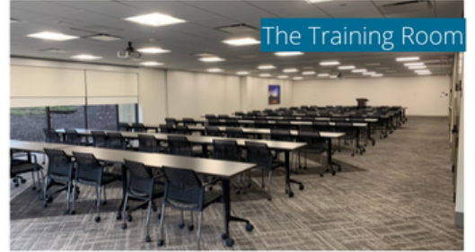
The Training Room