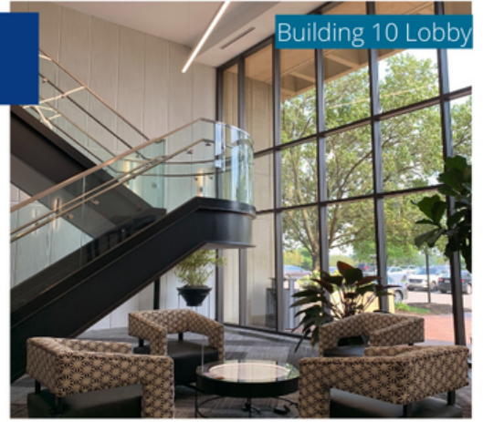
Building 10 Lobby

SWITCH UP THE SCENERY & HOST YOUR MEETING IN THE AMENITY CENTER! OUR ROOMS ARE EQUIPPED WITH WIFI, SMART/APPLE TVS, POLYCOM TELEPHONE, PROJECTOR WITH HDMI, WHITEBOARD WALLS, & PLENTY OF COMFY SEATING ALL WHILE CONVENIENTLY CLOSE TO OUR TENANT LOUNGE, CENTRAL STATION, & FOSTER CAFE.