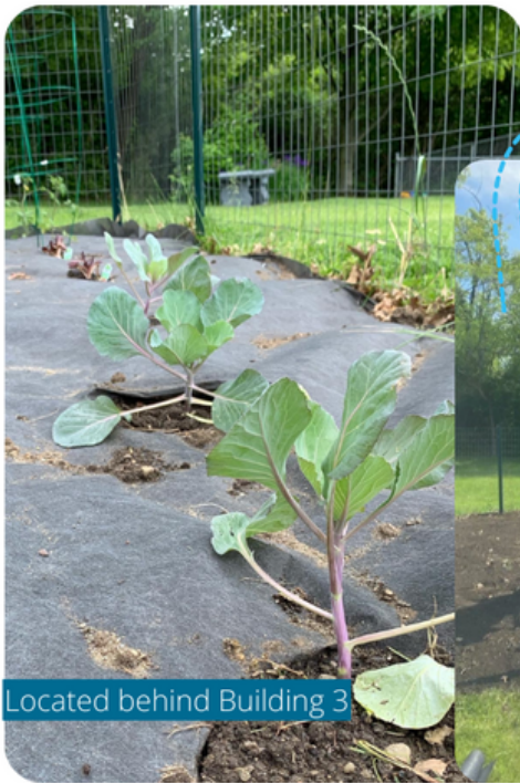
Located behind Building 3