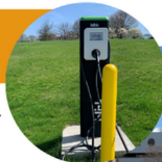
Located in Building 10's front lot near the Andersen Dr exit

Find more information in the LINKS section of page 5.