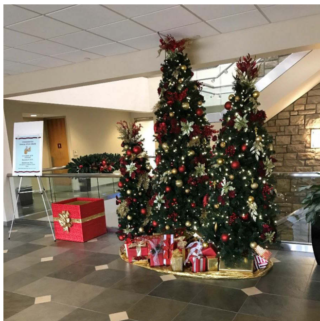
Pictured: Holiday Food Collection at Cherrington

We appreciate your help in making this one of our favorite events, and helping to give back to the community at such a crucial time. Please look out for information on possible food drives in the future, including virtually during this Summer 2021.